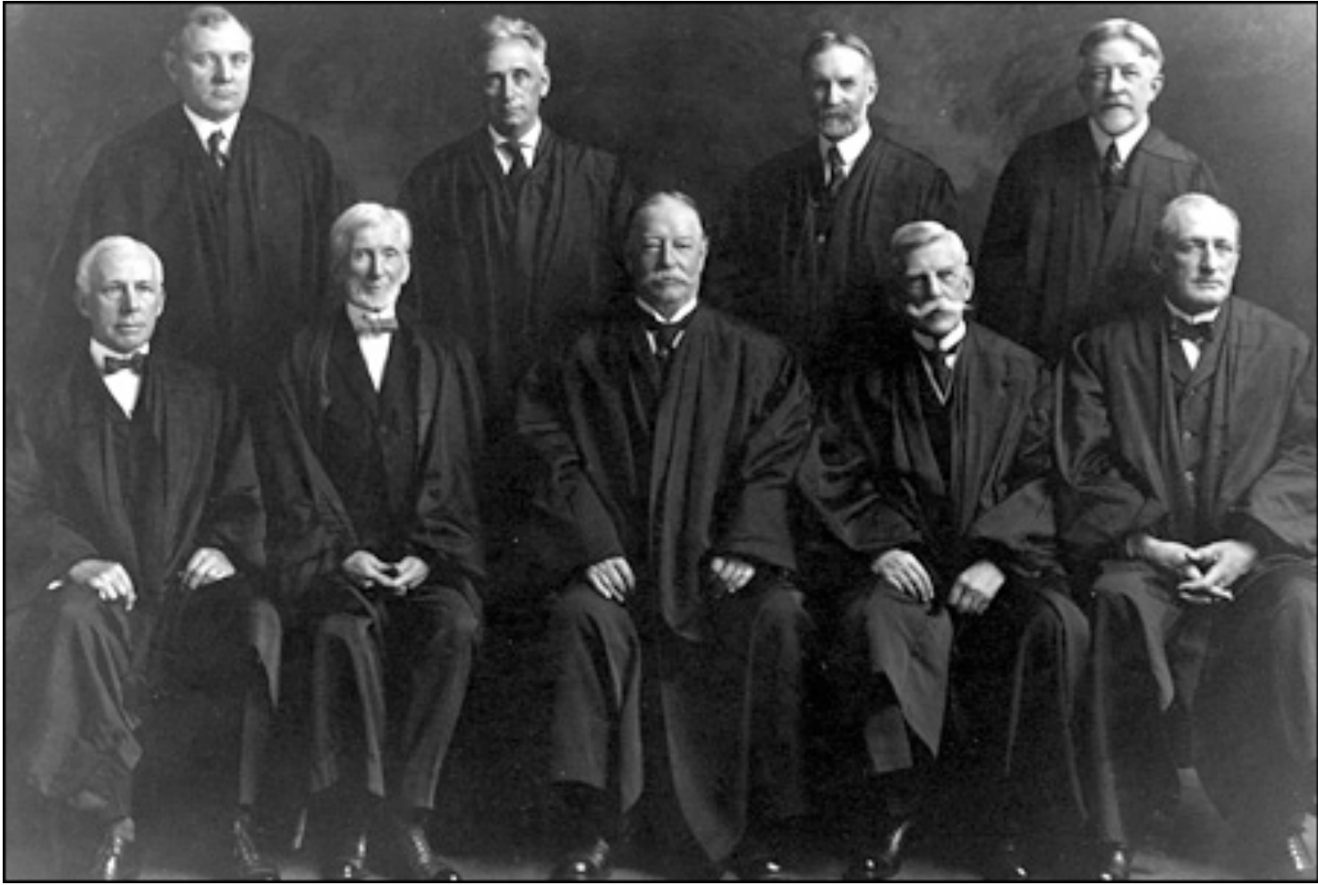
Taft Court, 1930