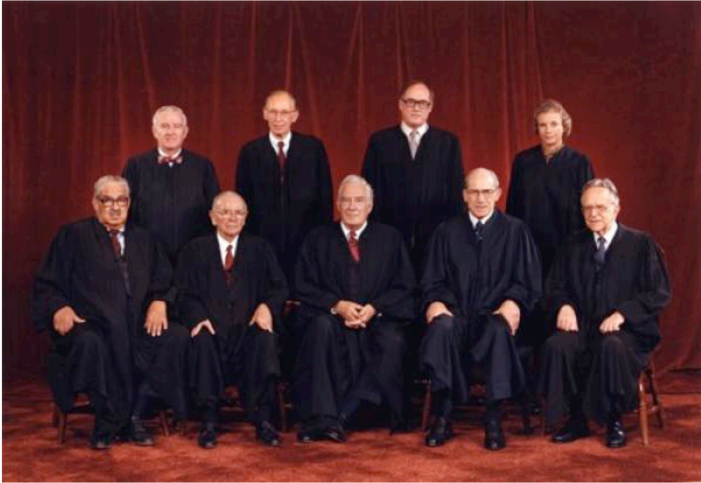
Berger Court, 1970