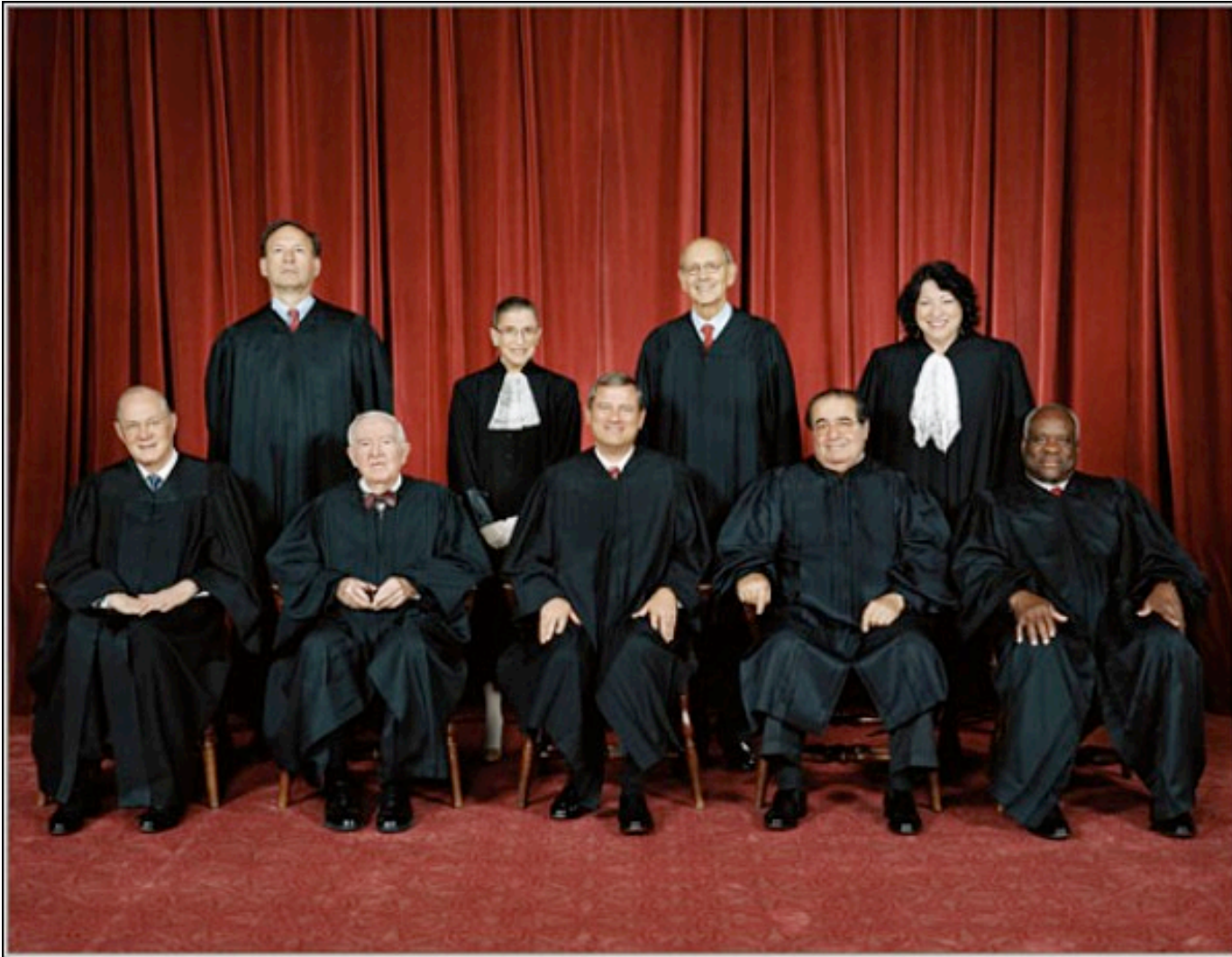
Roberts Court, 2010

This work was supported by the Bill and Melinda Gates Foundation